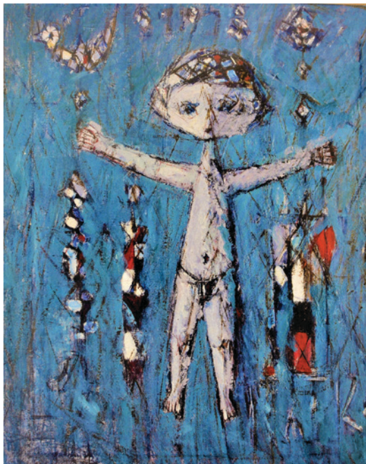
NO TITLE (Happy play, son Ratko) 1958 Oil on canvas