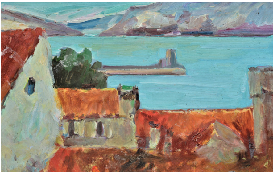
NO TITLE, The View from the Studio, around 1970, Oil on wood