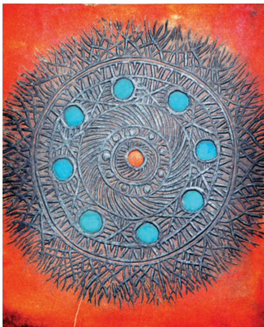
ROZETTE II 1970 Deep relief print

In the artistic legacy of Josip Restek, figurative works from the 1950s spark particular interest. In terms of content, they are related to human figure, individual children's figures or groups of children depicted in play. In terms of form, though, these are compositions of